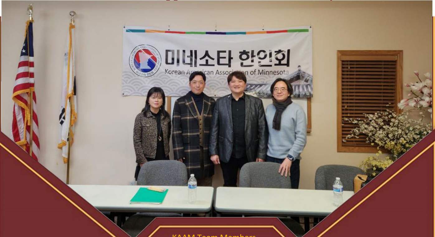
KAAM Team Members 미네소타 한인회 임원 일동

“KAAM will do our best to support the Korean community in 2023 as well!”